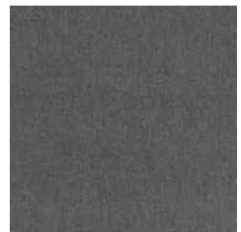
SHARK 32" X 32" RECTIFIED