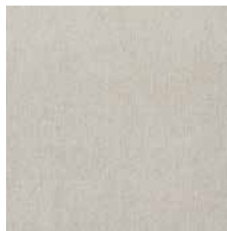
SAND 32" X 32" RECTIFIED