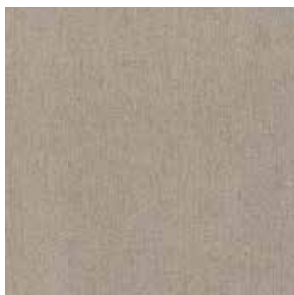
ECRU 32" X 32" RECTIFIED