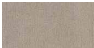
ECRU 16" X 32" RECTIFIED