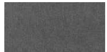
SHARK 16" X 32" RECTIFIED