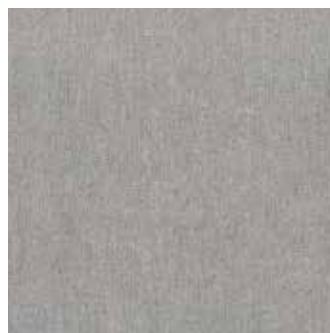
PEARL 32" X 32" RECTIFIED