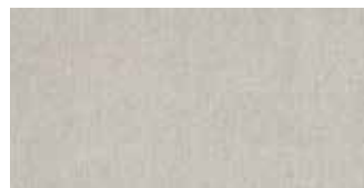
SAND 16" X 32" RECTIFIED