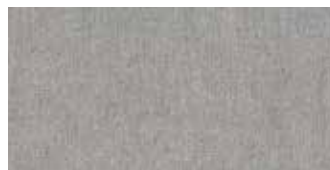
PEARL 16" X 32" RECTIFIED